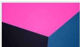
Design vs usability